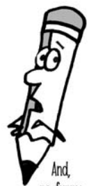
And, no funny nose jokes.

5. The Statue of Liberty’s nose is four feet six inches. Write a sentence that compares her nose to a real object of a similar length.